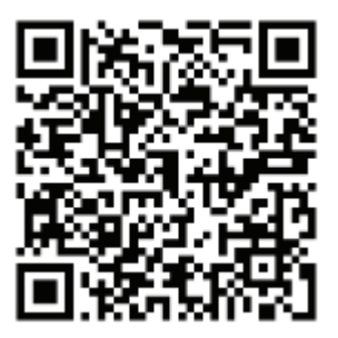
Scan this QR code, or visit farmerspridecoop.com/finance today to fill out a simple, one-page financing application!

SECURE<sup>™</sup> competitive rates and terms were all designed around your farming decisions within each of your prepay, tax, marketing, and operating cycles. Did we mention it's simple? Apply online quickly and move on with what matters most to you!